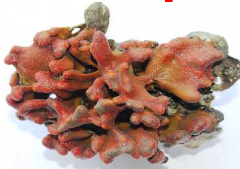
Clathria (Microciona) parthena